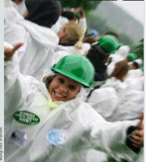
Young FoEE in action.