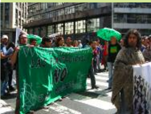
FoE groups at World Forestry Congress.

The program also participated in the 2009 World Social Forum in Belem, Brazil, co-hosting a workshop on plantations, market mechanisms and false solutions, with the Global Forest Coalition; and published "Community-based Forest Governance: from resistance to proposals for sustainable use."