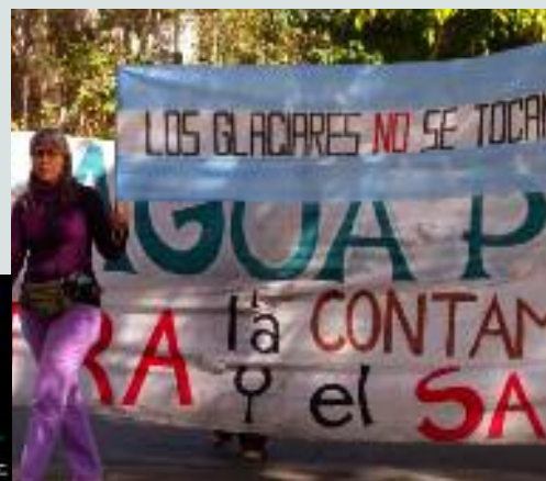
FoE Argentina water and glaciers for life.

with thanks to our funders: the Swedish society for nature conservation and the Dutch ministry of foreign affairs (dgis)