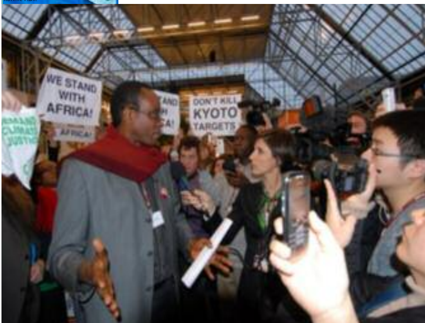
Nnimmo Bassey in Copenhagen.