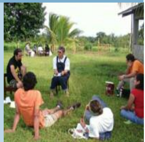
FoE Costa Rica hosts sustainability school.

with thanks to our funders: the isvara foundation