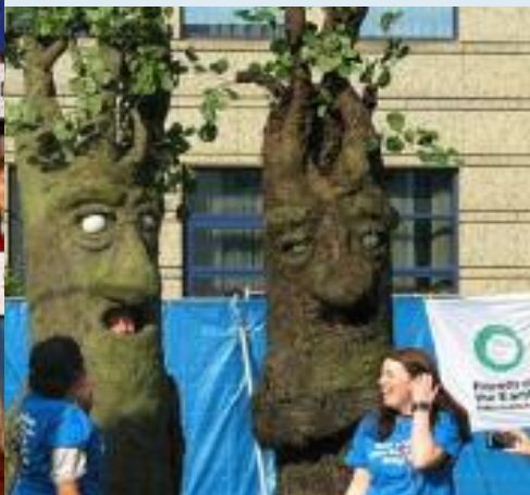
FoE forest campaigners at Bonn climate talks.