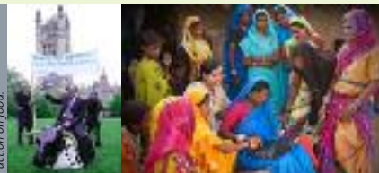
Women in India with laptop.