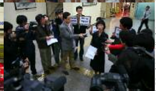
South Korea Environmental Law Center