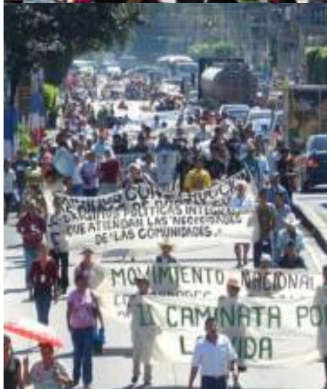
Fourth Continental Summit of Indigenous Peoples and Nationalities of Abya Yala.