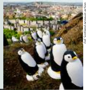
FoE Scotland penguin action.

FoE Germany/BUND, together with human rights and development NGOs, also delivered 10,000 signatures to the Colombian Embassy in Berlin, to protest against continuing human rights abuses in Colombia, which the expansion of the palm oil industry is fuelling.